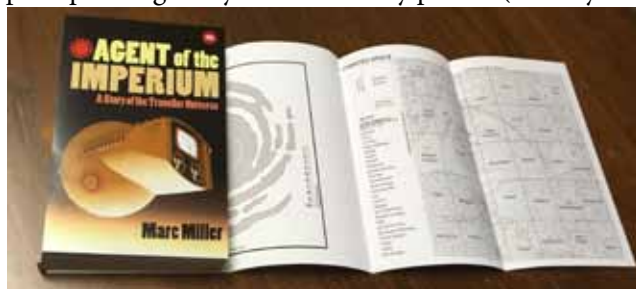
Includes back-of-the-book foldout Map of the Imperium, List of Emperors, and the Imperial Calendar.

If you know the Traveller science-fiction role-playing game, then some of this is already familiar; if not, no matter; this story is set in the Traveller universe, but requires no game-playing knowledge or experience. But, this story introduces the vast human-dominated interstellar empire of the far future in ways only its original designer and chronicler can.